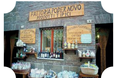
Shop for authentic Italian products

All of the packages above include a one-year subscription by mail to the award-winning newsletter Dream of Italy and online access to all of our back issues (45 + issues) —$89 value!