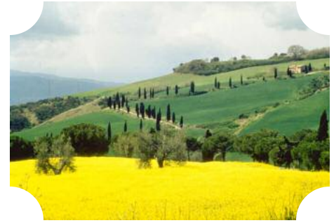
Exploring the Tuscan countryside

My unique perspective as a writer and Italian travel expert allows me to approach travel planning from the "experience" of travel rather than the "business" of travel. Indeed, unlike a travel agent, The Italian Dream Concierge doesn't accept referral fees or commissions for recommendations. (You can take our itinerary to your own travel agent or seamlessly book through one of our partner agents for no extra charge.)