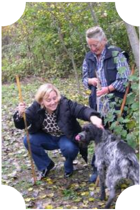
Truffle hunting near Alba

Gift certificates available – makes a unique holiday present!