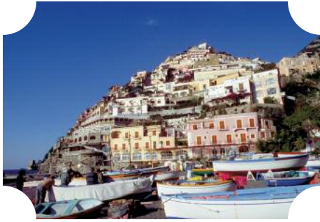
Positano, along the Amalfi Coast

For five years now, those seeking unique, timely and exclusive information on travel to Italy have turned to Dream of Italy, The Insider's Guide to Undiscovered Italy . During that time, I have fielded hundreds of phone calls from readers asking for assistance in planning trips incorporating our special finds. That's why I am introducing The Italian Dream Concierge , a travel planning service devoted to bringing you the same authentic and insider Italy that Dream of Italy presents in its pages.